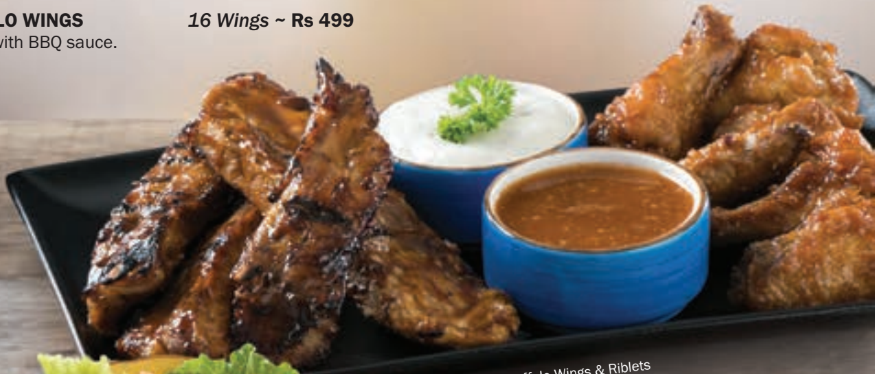
Buffalo Wings & Riblets

CALAMARI SALAD Rs 479 Tender calamari rings, fried in a light batter, on a Greek salad.