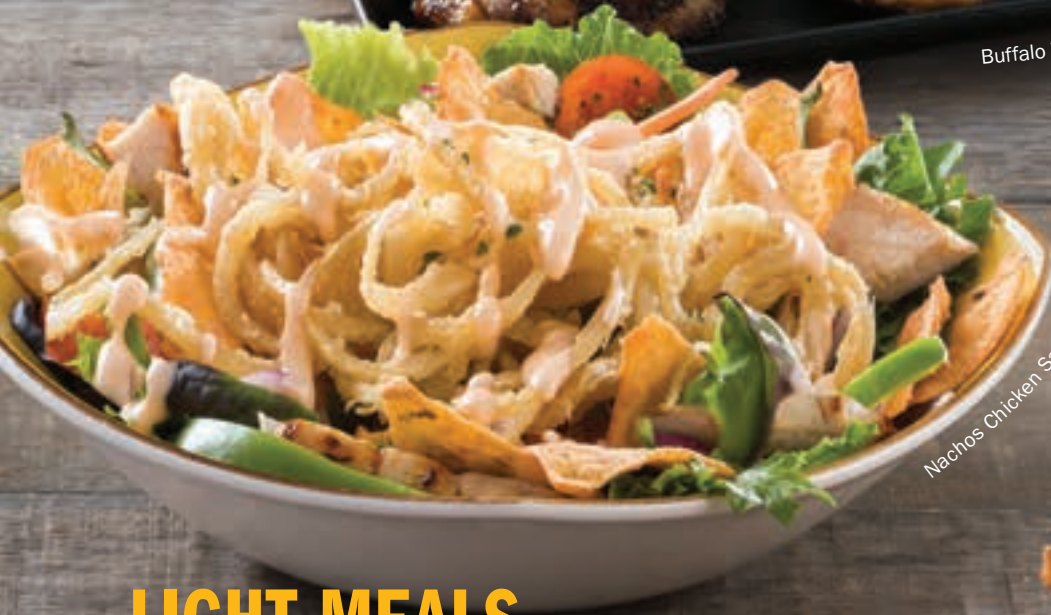
Nachos Chicken Salad