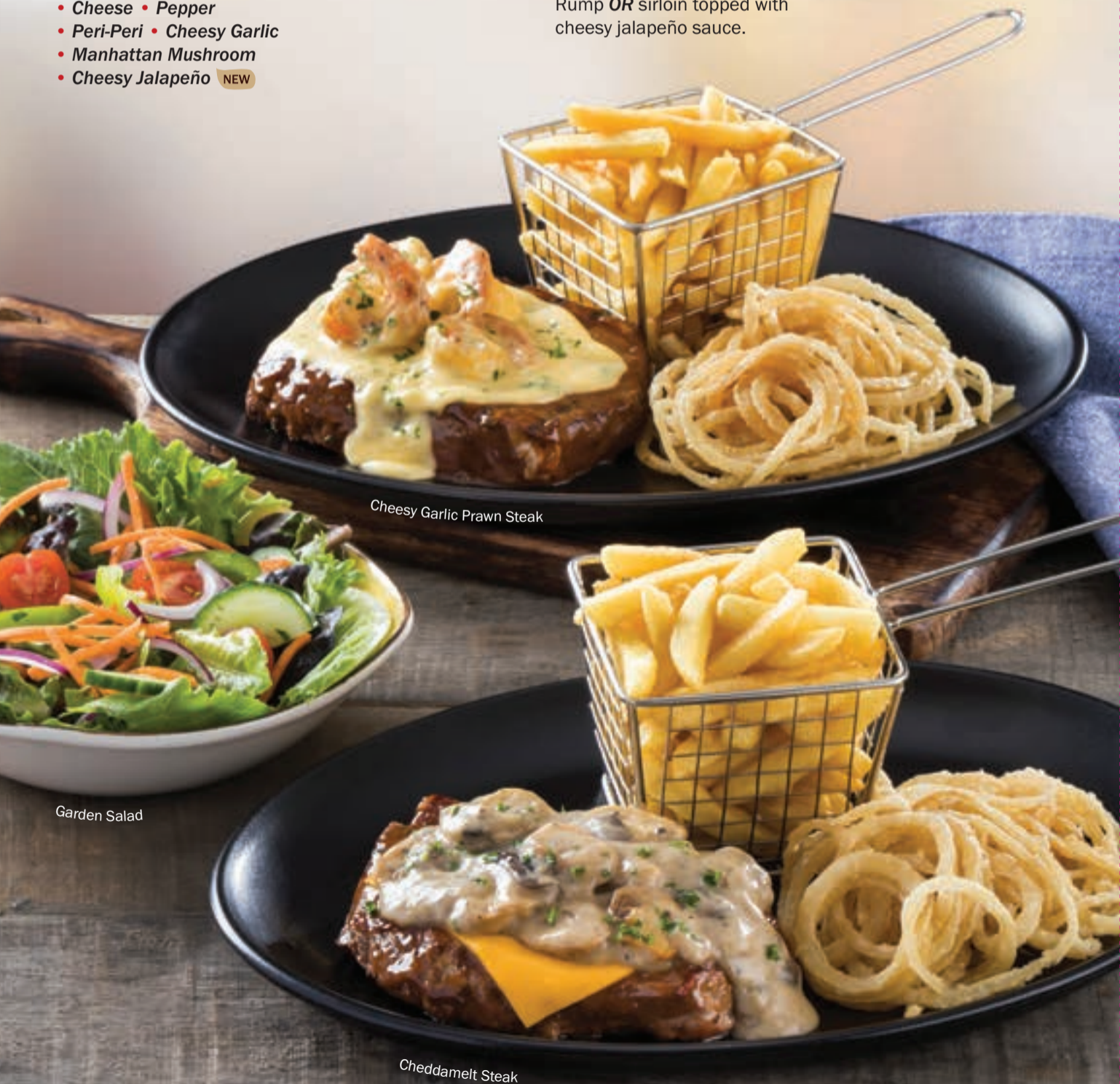
Cheesy Garlic Prawn Steak