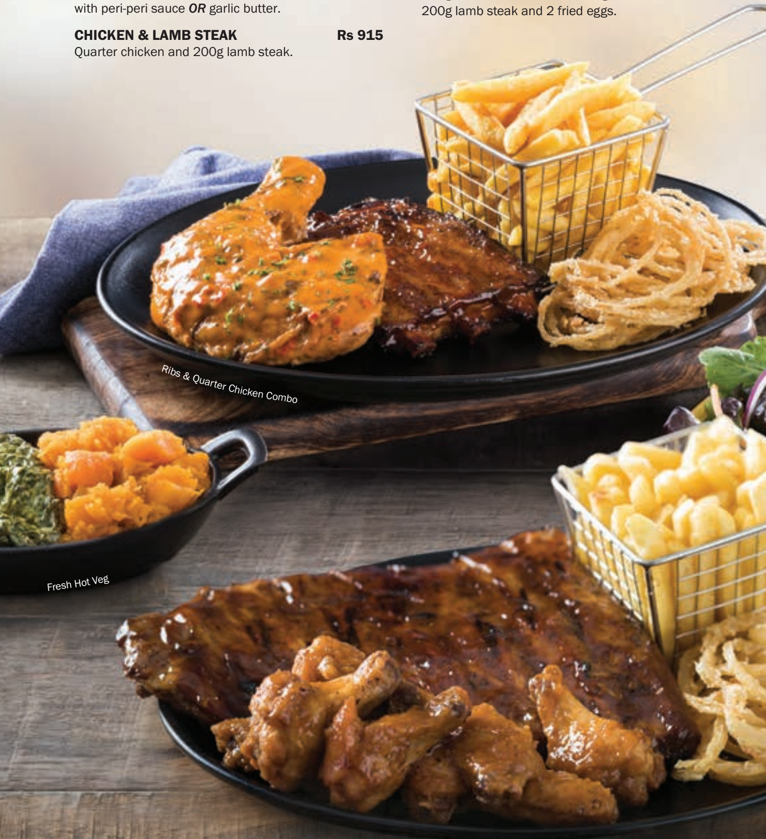
Ribs & Quarter Chicken Combo