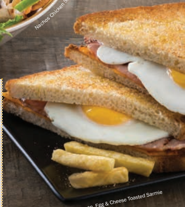
Bacon, Egg & Cheese Toasted Sarmie

Grilled chicken breast strips with a sweet chilli dressing, guacamole, lettuce, julienne carrots and cherry tomatoes rolled up in a lightly toasted tortilla with melted cheese.