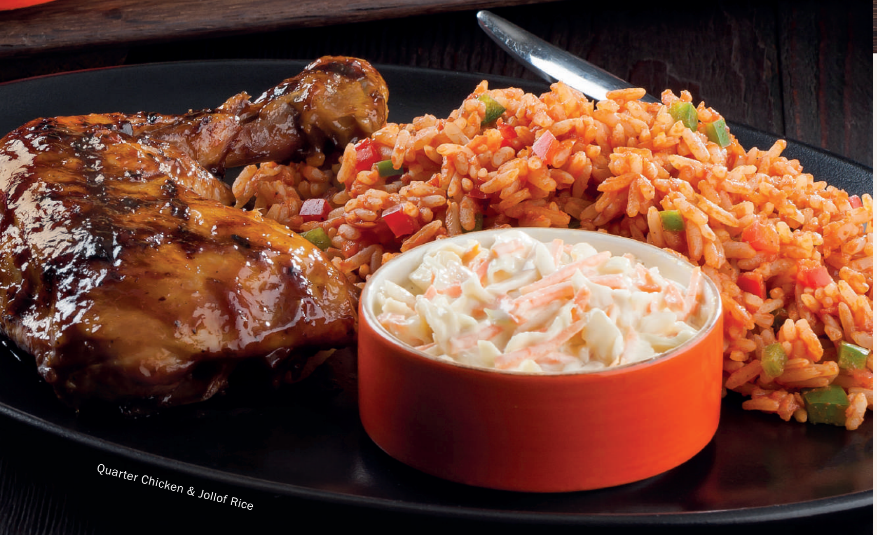
Quarter Chicken & Jollof Rice