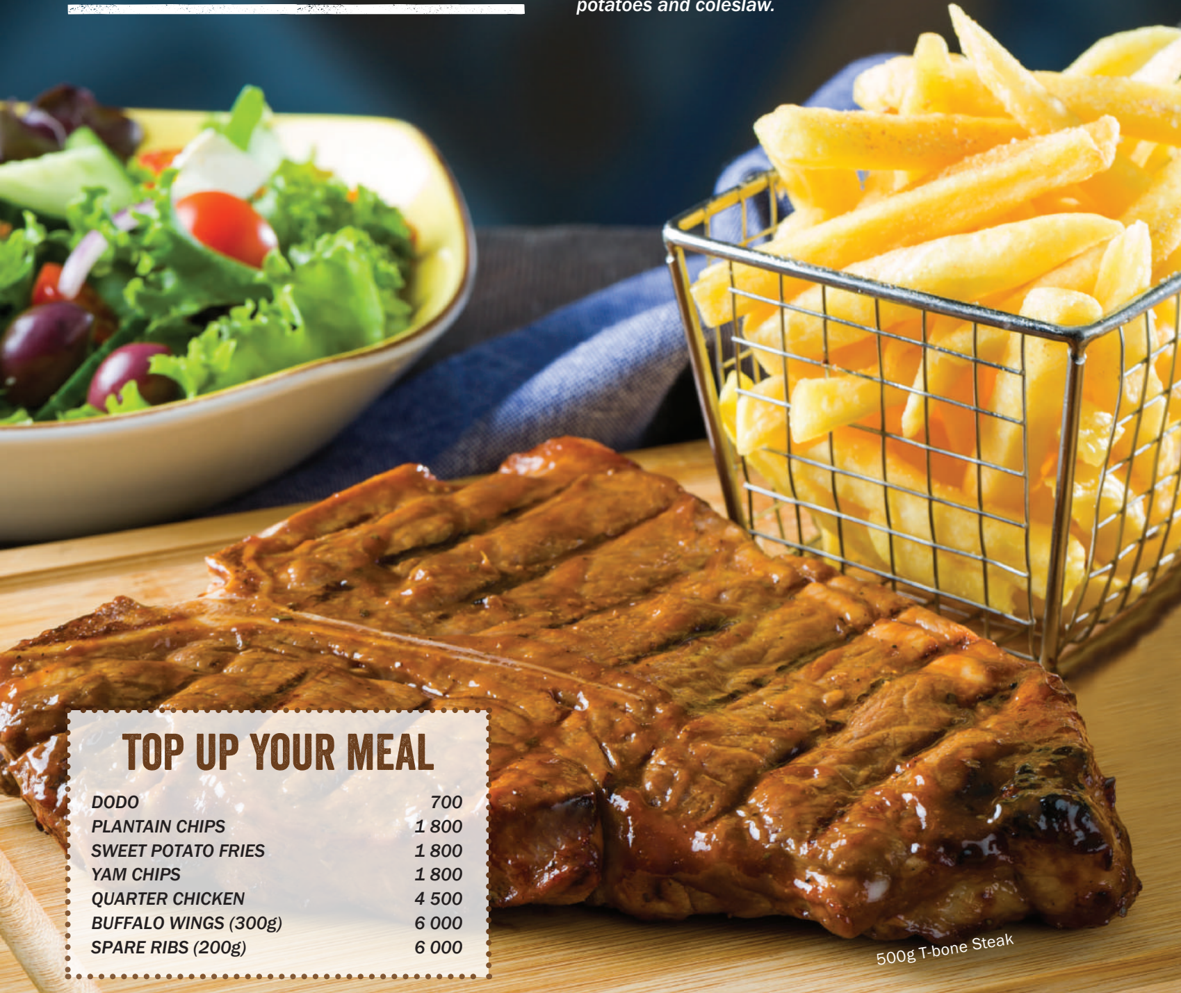
500g T-bone Steak

Served with your choice of French fries, jollof rice, fried rice OR mashed potatoes and coleslaw.