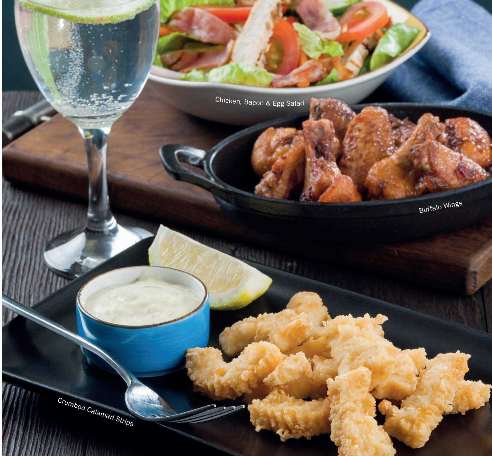
Chicken, Bacon & Egg Salad