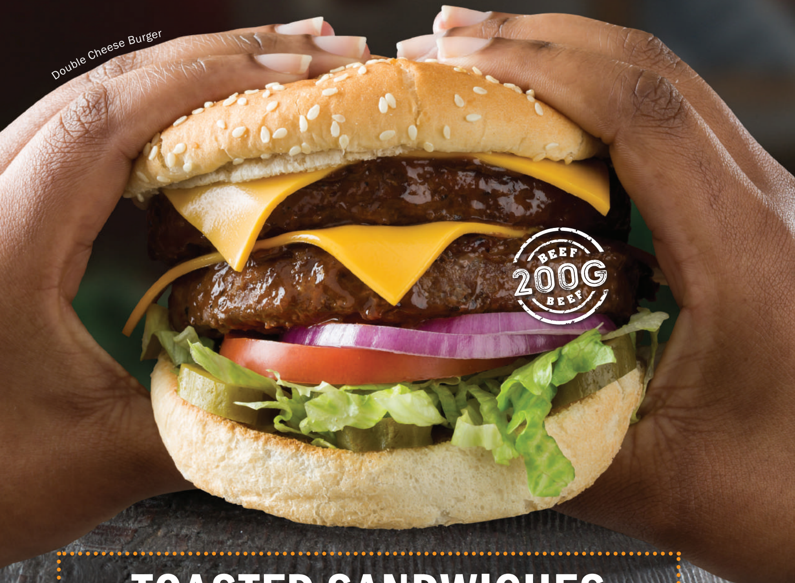
Double Cheese Burger